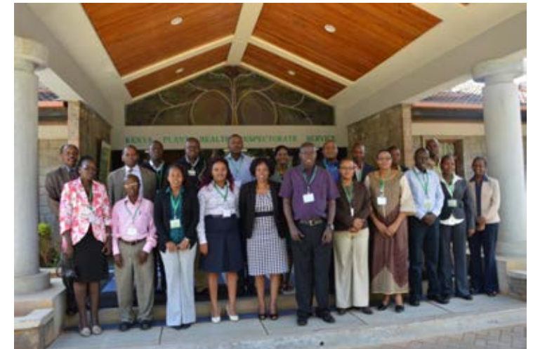
Regional Pest Risk Analysis meeting